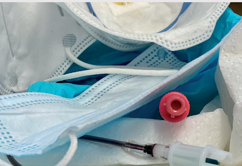
Offensive and Clinical Waste Removal